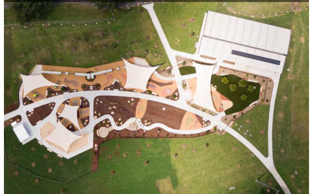
Meadowbank Park Regional Playground City of Ryde