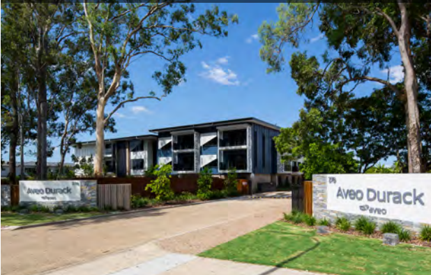
AVEO Durack FKG Group