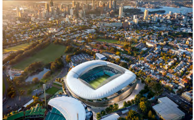
Sydney Football Stadium Redevelopment John Holland