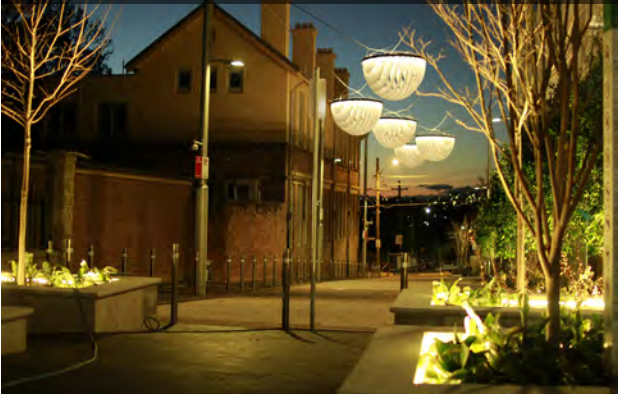
Coulter Street Upgrade City of Ryde