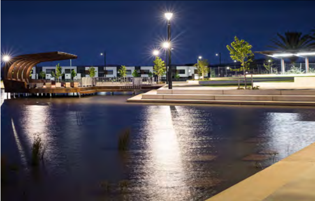
Bunyip Park, Googong PEET